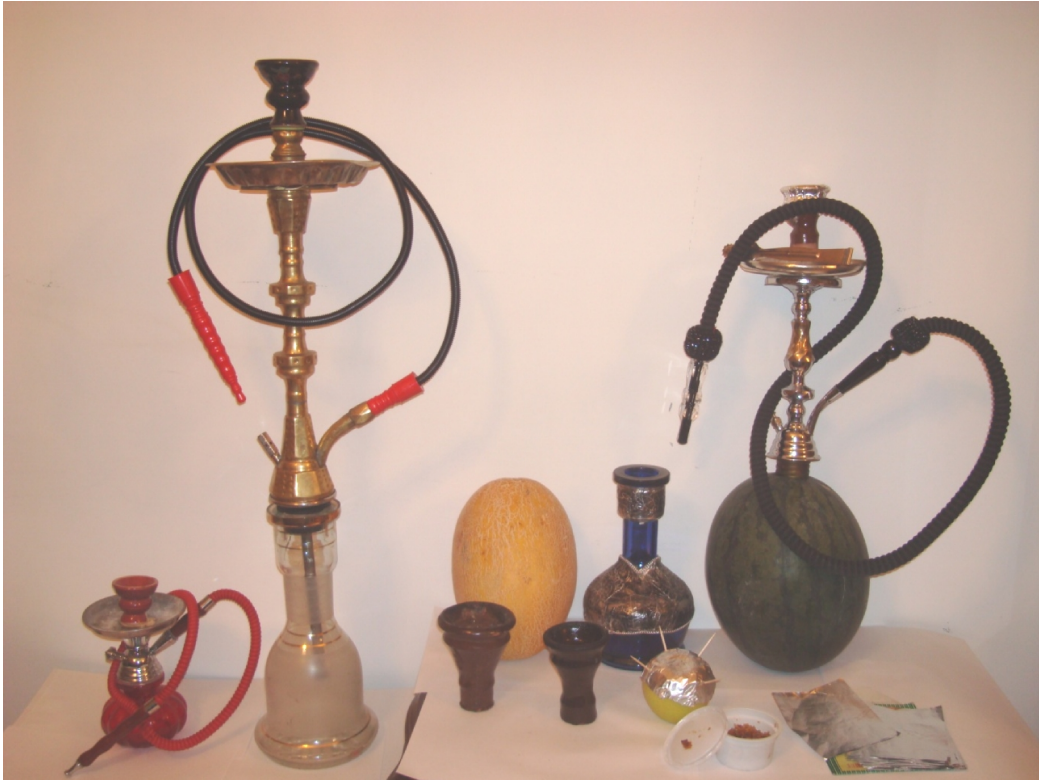
Fig. 1. Two conventional narghiles are shown on the left-hand side. An apple can replace the head of the narghile while a melon or a watermelon can replace the tank (right side)

Fruit-flavored tobacco mixtures, which list "Muassel" as an ingredient, burn with a strong aroma of caramelizing sugar [12]. It is considered one of the factors that make narghile smoking an attractive and trendy habit [13]. On the other hand, fruits that can be used to replace the head of the narghile include apples that are hollowed in the centre and a hole is made at the bottom half to transfer smoke down to the tank.