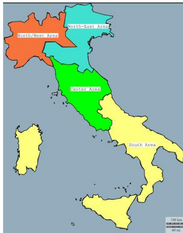
Figure 1. Geographical Macroarea.

Abruzzo is classified as Southern Italy for historical reasons, as it was part of the Kingdom of the Two Sicilies before the unification of Italy in 1861 (Figure 1):