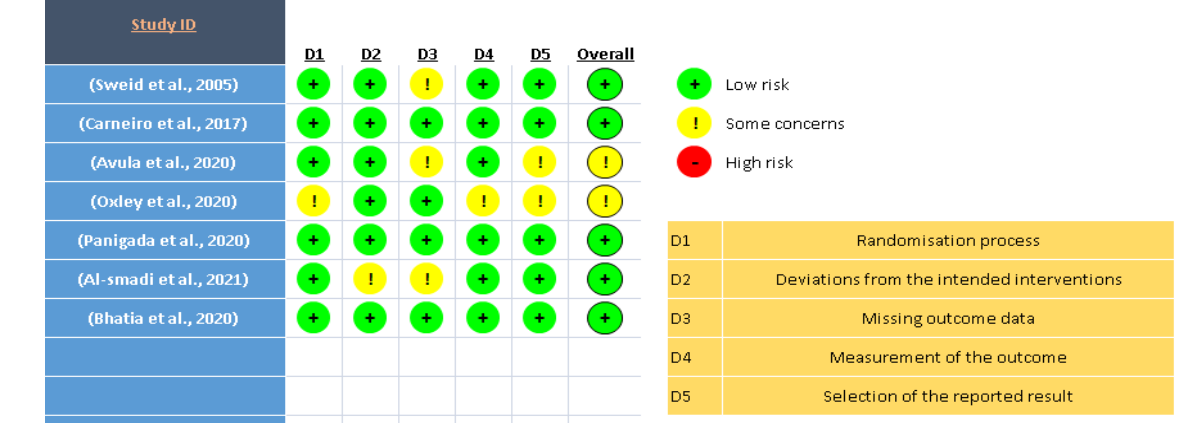
Fig. 2. Risk of bias of the individual studies reviewed

There was a collective low risk of bias of all the reviews and this was assessed using a revised Cochrane's risk of bias method, by identifying any of the following domains: randomization process, deviations from the intended interventions, outcome missing data. measurement of the outcome, and selection of reported result. Few studies showed the ambiguities in one of the aforementioned domains (Fig. 2), but the overall bias was mostly 'low risk' (Fig. 3).