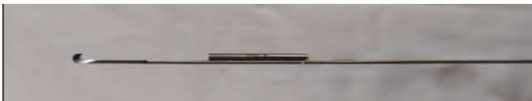
Fig. 2. Sickel shape cold knife