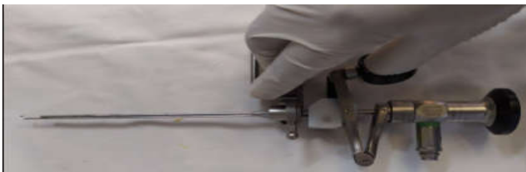
Fig. 3. Cold knife set with resectoscope working element