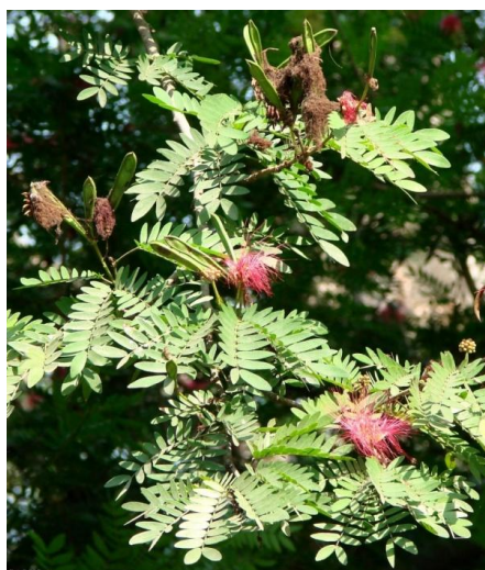
Fig. 1. Calliandra haematocephala Hassk

Although several macromorphological and pharmacological studies have been conducted on Calliandra haematocephala , detailed information of micromorphological characters like surface indumentum and trichome morphology is not well investigated. Present study was conducted to explore the structural diversity and distribution of trichomes, and vestiture types on the surfaces of all vegetative as well as reproductive parts to fill the void in information regarding micromorphology of Calliandra haematocephala .