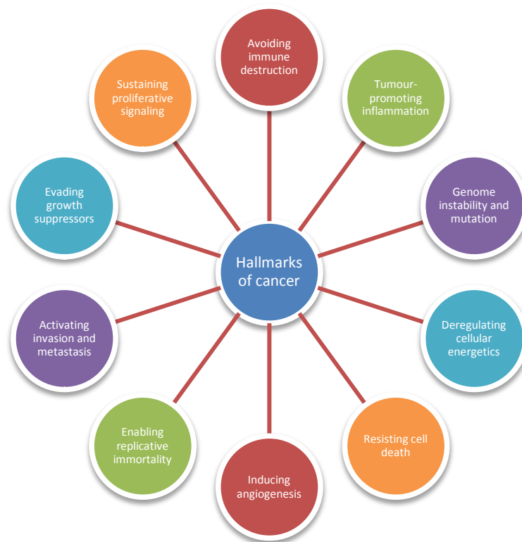
Figure 1. The ten hallmarks and characteristics of cancer. Adapted from Ref. [10].