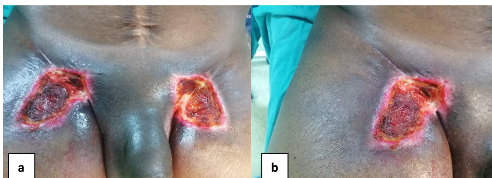
Fig. 1. Skin radionecrosis in bilateral groin regions