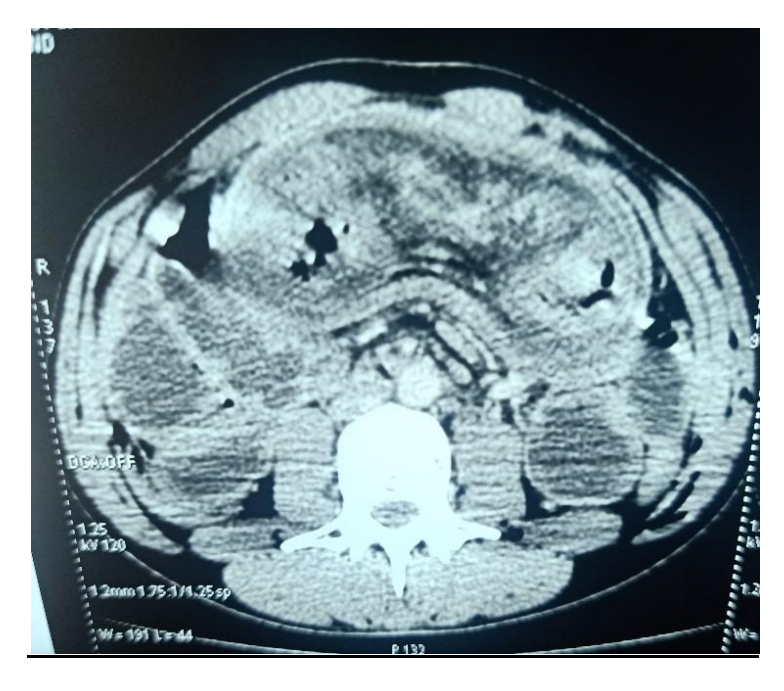
Fig. 1. Axial CT of the abdomen shows the presence of a bowel-within-bowel, characteristic for intussusception

The immuhistochemical study shows expression of AML (actine muscle lisse), desmin and absence of expression of CD34, CD117 and PS100. This immunohistochemistry aspect is compatible with a small bowel leiomyoma.