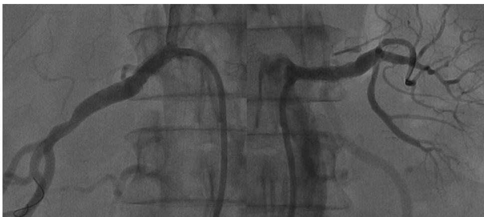
Fig. 2. Selective renal angiography after bilateral balloon catheter angioplasty