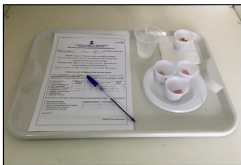
Fig. 2. Cabin prepared for sensory analysis

The mortadella samples, under the different aromatic extract concentrations, were served in cubes in white disposable plastic cups, coded with three-digit randomly defined numbers, accompanied by a water-salt biscuit and a glass of natural mineral water for cleaning the palate between sample exchanges (Fig. 2).