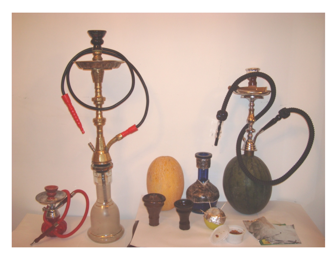
Fig. 1. Two conventional narghiles are shown on the left-hand side. An apple can replace the head of the narghile while a melon or a watermelon can replace the tank (right side) A courtesy of Mr Ahmad Jaber, a dental student at the University of

Fruit-flavored tobacco mixtures, which list "Muassel" as an ingredient, burn with a strong aroma of caramelizing sugar [12]. It is considered one of the factors that make narghile smoking an attractive and trendy habit [13]. On the other hand, fruits that can be used to replace the head of the narghile include apples that are hollowed in the centre and a hole is made at the bottom half to transfer smoke down to the tank.