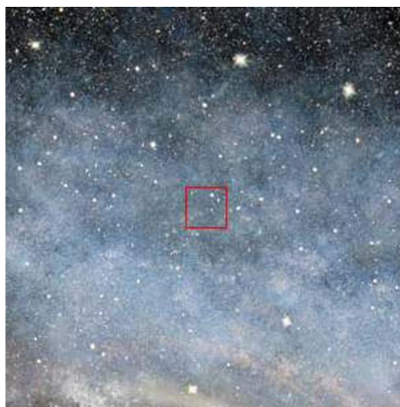
Figure 1. Observing the earth from 10,000 light years away (100,000 trillion km).

According to Dirac’s theory, the particle characterized with wave-particle duality exists and doesn’t exist at the same time. But it does in fact exist in the three-dimension, because things we see are composed of particles, as showed in Figure 2 .