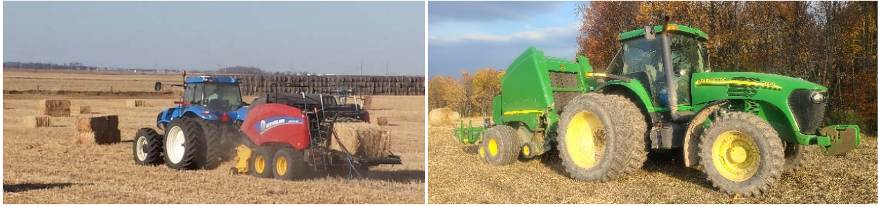
Figure 2. Large Square Baler (left), Round Baler (right).

machinery manufacturers developed new equipment continuous round balers, which could wrap and drop the round bale without stopping. Other companies developed large square balers, which could bale constantly without interruption and are estimated to have a lower cost per unit of harvested area [6]. One downside to utilization of balers is the inability to completely collect all biomass that has been mowed, resulting in losses.