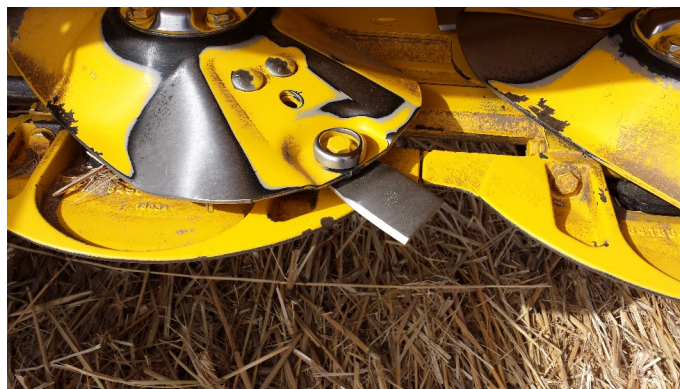
Figure 1. Disc mower blade.

Switchgrass drying rate can be improved through a combination of intensive conditioning and wide swath drying. This method of roll conditioning crushes and scuffs the stems which disturbs the plants' cutin layer and flattens the stem nodes. This provides a better way for water vapor to leave the stem and dry faster. Although, wide swath drying decreases field drying time, it requires an additional field operation to rake wide swaths into windrows that can be picked up with commercially available balers [16].