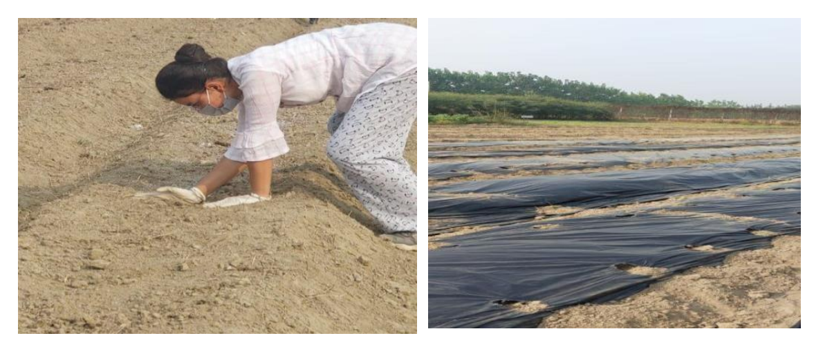
Plate 3. Application of fertilizers