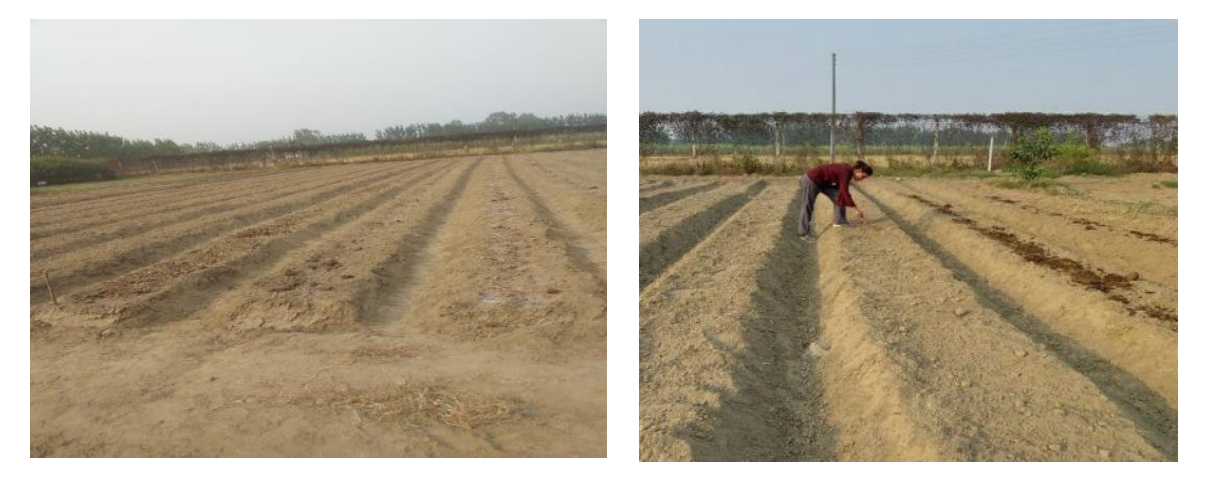
Plate 1. Raising of seed beds

length, width and thickness decide the physical appearance of the fruit and TSS and Acidity decide the taste and flavour of the fruit) like fruit length (mm), fruit width (mm) and fruit thickness (mm) were calculated with the help of Vernier calipers. Fruit weight (g) was measured by using weighing machine. TSS (°Brix) was calculated by using a digital refractometer. AOAC's suggested approach was used to determine the Titrable acidity (%). Firmness (N) was measured with the help of digital penetrometer. According to the statistical process for Agricultural Research, the mean values of the data will be subjected to analysis of variance. Randomized Block Design. Utilising a method and algorithms, various statistical parameters were computed. The mean of the qualities was compared using ANNOVA (Analysis of Varience) [4].