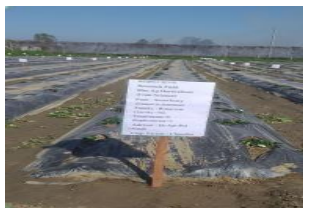
Plate 5. Plantation

Kour et al.; J. Adv. Biol. Biotechnol., vol. 27, no. 2, pp. 179-185, 2024; Article no. JABB. 113308