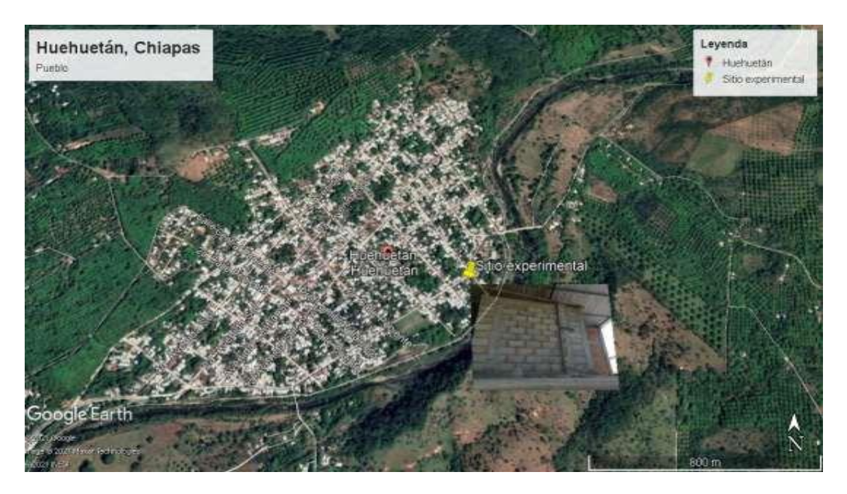
Fig. 1. Geographic location of the study area

Camposeco et al.; J. Global Agric. Ecol., vol. 16, no. 3, pp. 21-29, 2024; Article no.JOGAE.12203