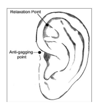
Fig. 1. Acupuncture at anti-gagging point (Hashim)