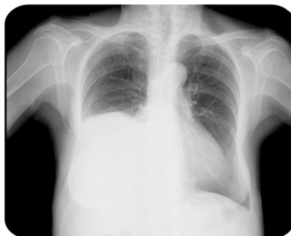
Figure 1. Chest radiograph showed elevation of the right hemidiaphragm.

CYFRA21-1, CA 19-9, NSE and CEA were within the reference values.