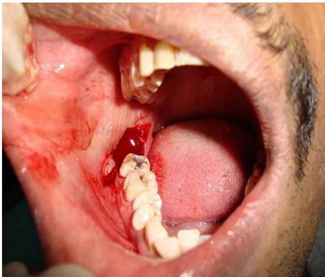
Figure 2. Extraction of impacted 48 done.