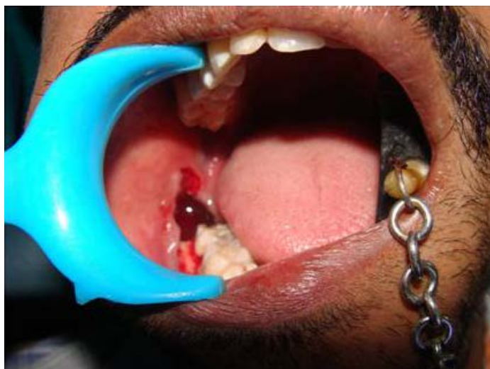
Figure 4. Clot formation.

bleeding pressure pack is given on both sites.