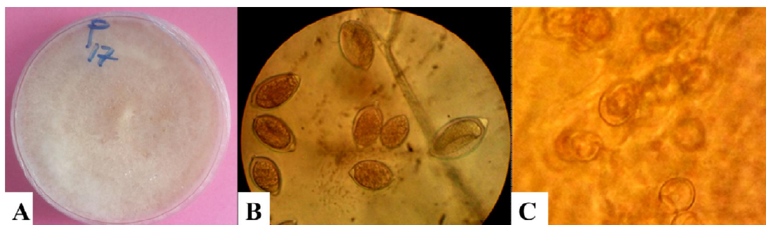
Fig. 1. Macroscopic and microscopic characters of a pure 14-day-old HPMN02 isolates of P. infestans from Ngui locality on V8 medium (A), sporangia (B) and zoospores (C) seen with a photonic microscope (magnification X 100)

The shape of the sporangia varied from isolate of one Division to another. A total of 8 shapes (Fig. 2) were observed; these are: oval to ellipsoid; ellipsoid; pip form; elliptic; subglobose; globose; ovoid; lemoniform. These sporangia are deciduous and have papillae and short pedicels typical of P. infestans . These shapes revealed that the populations of P. infestans in HAZ in Cameroun are highly diverse. The new shape of sporangia from different isolates as pip form and oval to ellipsoid can be observe.