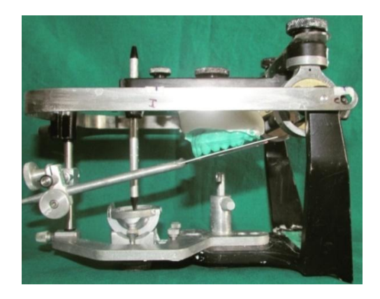
Fig. 3. Mounting of maxillary cast on articulator

For the ease of measurement, a steel plate was fixed above the bite fork with an adhesive (Fig. 5).