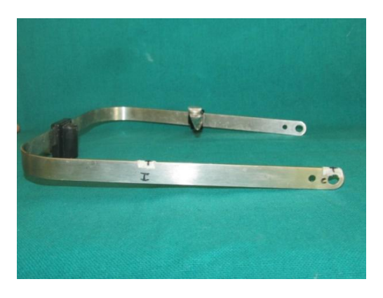
Fig. 4. Points I and C marked on U shaped frame of facebow