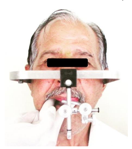
Fig. 1b. Facebow transfer in edentulous patient

Following this, alginate impressions (Algitex, Mumbai) were now made for all the 40 subjects (with complete denture worn in edentulous cases) for both upper and lower arches followed by pouring of casts in Type III gypsum (Kalstone, Kalabhai Karson Pvt Ltd, Mumbai). Facebow transfer was done next and casts were mounted (Figs. 1-3).