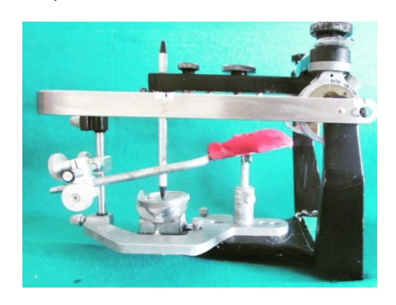
Fig. 2. Facebow with bite transferred on to the articulator

The plane formed by C and I was corresponded to Frankfurt horizontal plane. These two point