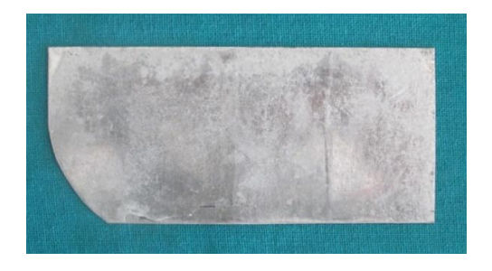
Fig. 5. Steel plate