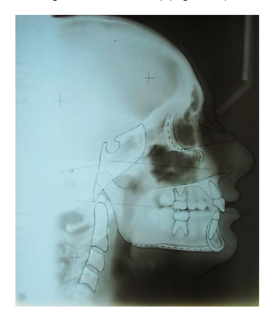
Fig. 9a. Tracing of lateral cephalogram of dentulous patient

Following lead foil placement, the lateral cephalogram was taken for all the subjects (patient wearing denture in edentulous patients) with Frankfurt horizontal plane parallel to the ground in a cephalostat (Planmeca X- ray machine, model 2002). Tracing was done to evaluate the angle between Frankfurt horizontal plane and the occlusal plane (formed by line joining the mesiopalatal cusp of upper molar and incisal edge of central incisor) (Fig. 9 a-b).