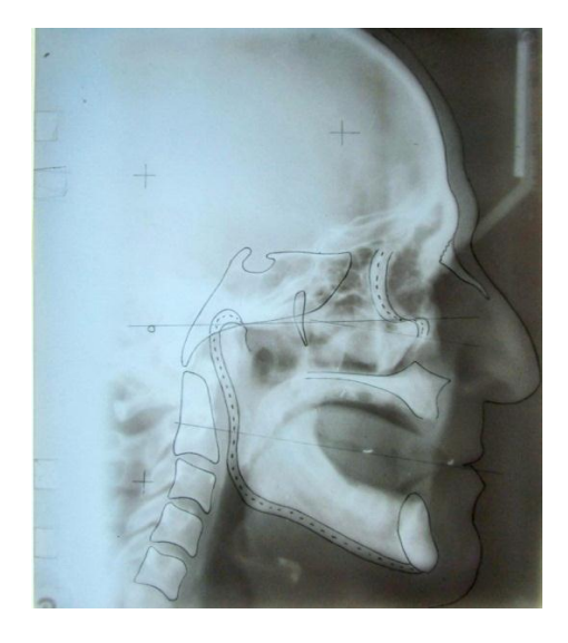
Fig. 9b. Tracing of lateral cephalogram of edentulous patient